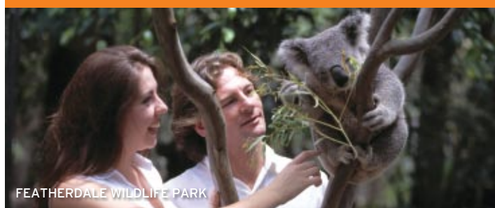
FEATHERDALE WILDLIFE PARK

MEAL CODE Included meals are indicated on relevant itineraries: L Lunch