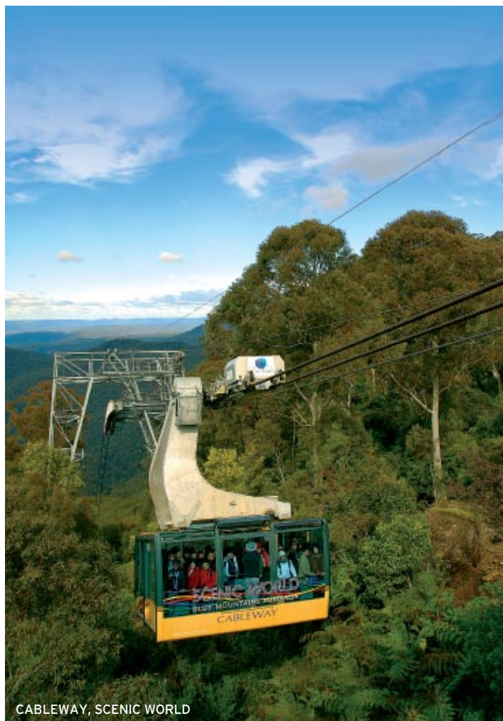
CABLEWAY, SCENIC WORLD